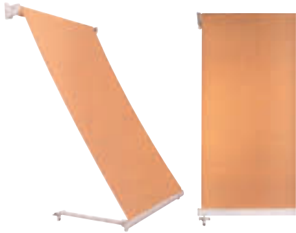
BRAVO DROP BLIND/AWNING