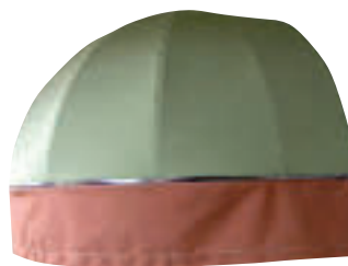
QUARTER BALL AWNING