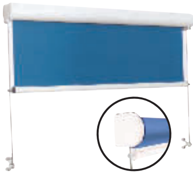
DROPPY VERTICAL BLIND