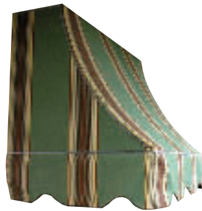
CASEMENT WINDOW AWNING