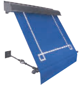
RETRO DROP ARM AWNING